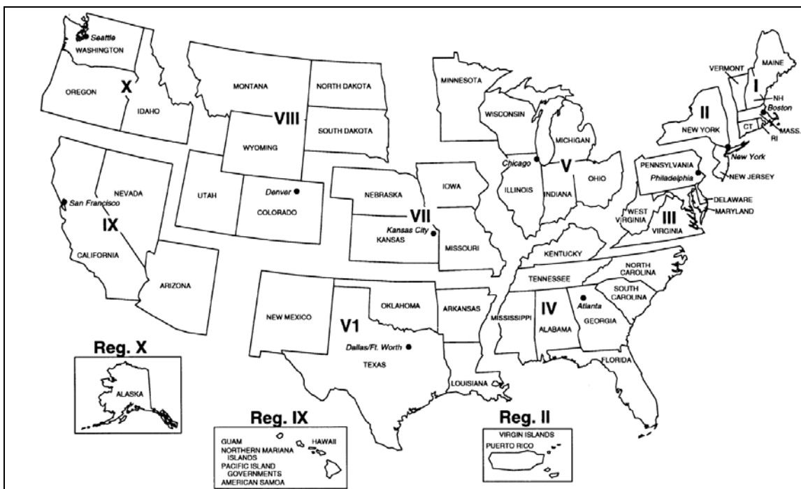
Figure 2. Standard State and Territorial Boundaries for Federal Regions