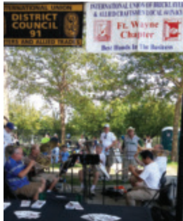
Fort Wayne Philharmonic Players Association