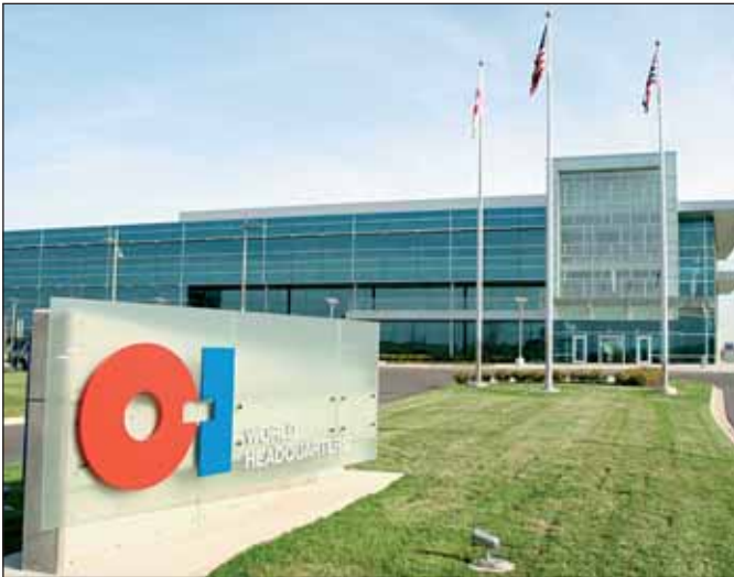
O-I Headquarters in Perrysburg, Ohio