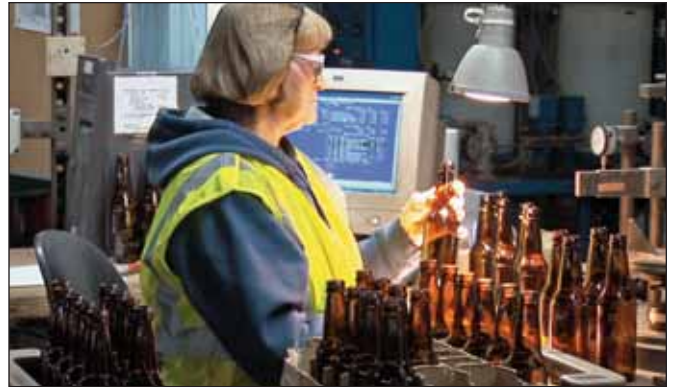
GMP members performing their jobs.