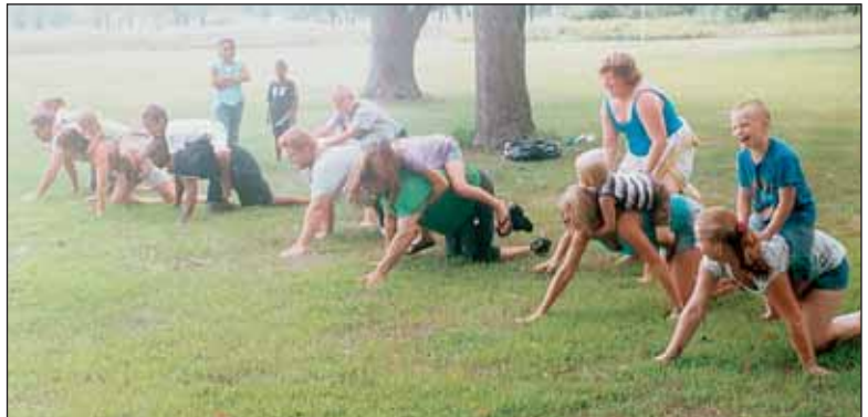
Parents and children enjoying the "piggy-back" race.

LOOK FOR THE LABEL BUY UNION BUY AMERICAN BUY CANADIAN