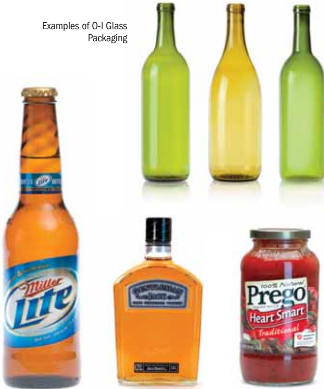
Examples of O-I Glass Packaging