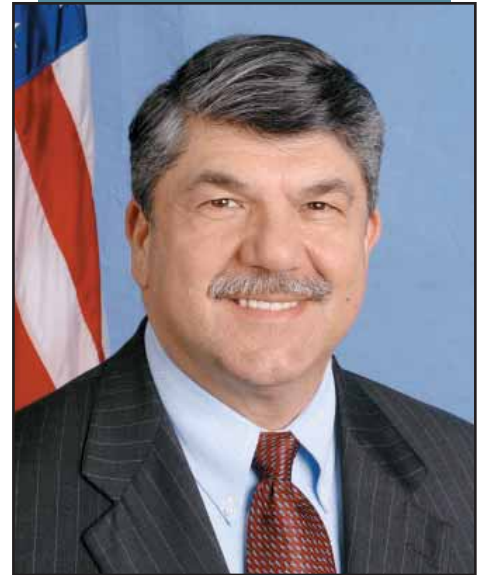
RICHARD TRUMKA President AFL-CIO