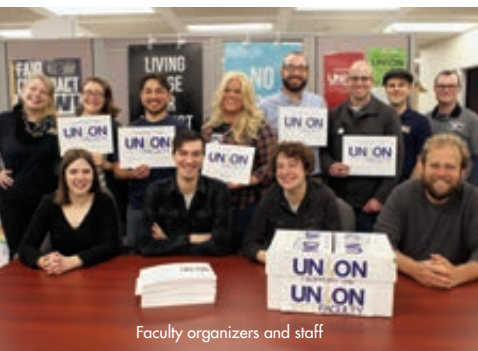
Faculty organizers and staff