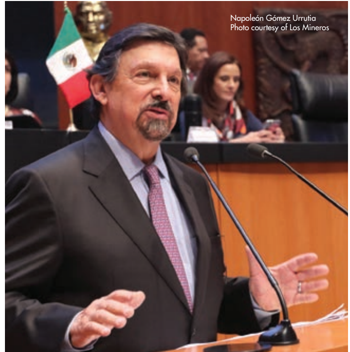
Napoleón Gómez Urrutia