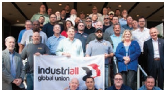
Union members attend IndustriALL meeting in Pittsburgh.

Representatives from the following unions participated in the meeting: the USW; the International Union of Operating Engineers; Texas City Metal Trades; the International Chemical Workers Union Council/United Food & Commercial Workers; National Conference of Firemen and Oilers; the Amptill Rayon Workers Incorporated; the Dow Chemical European Employee Forum; the Dow Chemical-Stade Works Council (Germany); UNITE the Union (United Kingdom and Ireland); the Global Union Federation IndustriALL (Switzerland); the Union of Workers and Employees Petrochemicals States-SOEPU (Argentina), and the Chemical, Energy and Mines Workers Union (Indonesia).