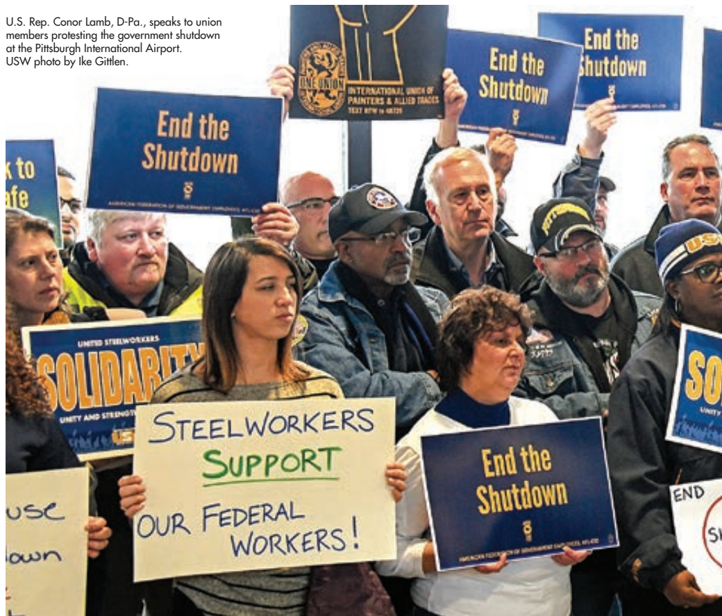
U.S. Rep. Conor Lamb, D-Pa., speaks to union members protesting the government shutdown at the Pittsburgh International Airport.

The Commerce Department had been scheduled to issue final anti-dumping and countervailing duties against Chinese wheel importers on the same day as the ITC hearing, but trade