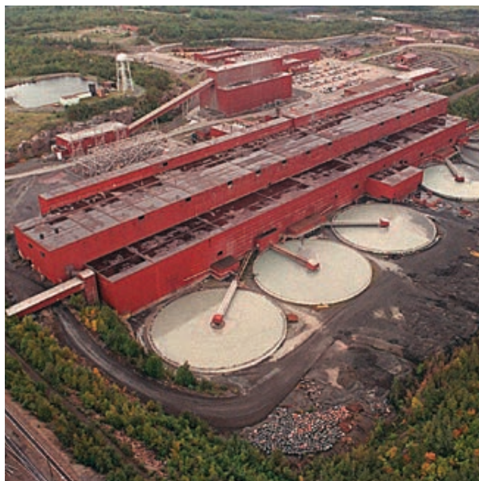
Former LTV processing plant.

The PolyMet project still must clear additional regulatory hurdles, including air and water quality permits from the state's pollution control agency as well as a permit from the Army Corps of Engineers, among others.