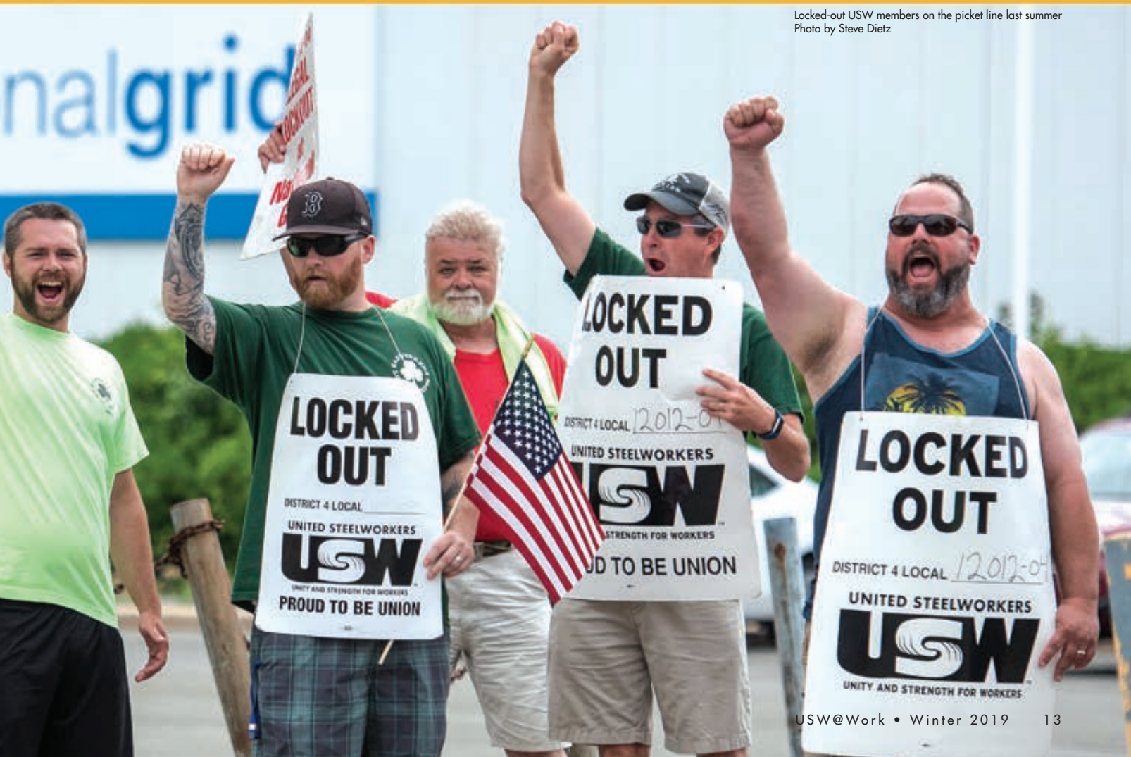
Locked-out USW members on the picket line last summer