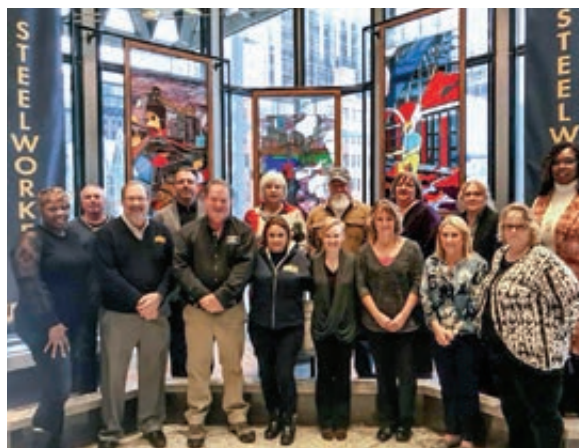
Members of the Health Care Workers Council pose in the USW lobby.

The HCWC steering committee was a result of a resolution passed at the 2017 Constitutional Convention. It called for each District Director with