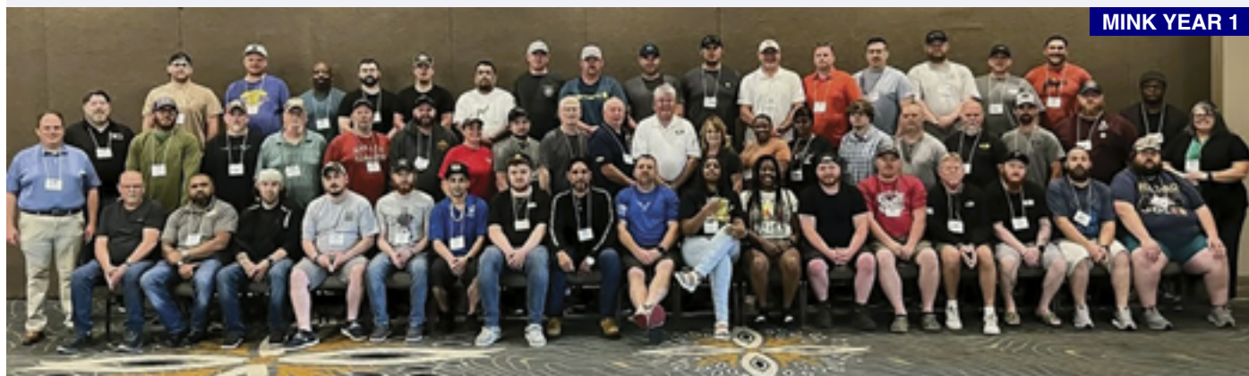
MINK YEAR 1

Thanks to all members who attended and a special thanks to all the instructors who participated.