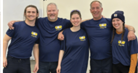
Frontier Ambulance Fremont County, WY

quality workers who want to stay so our patients get the best care possible, and get our wages to a more competitive place."