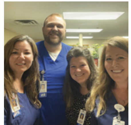
Fairview Hospice and Homecare Hibbing, MN