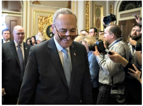
Senate Minority Leader Chuck Schumer

In a rare victory for seniors, the passage of the FY 2018 Omnibus Appropriations bill in Congress increases funding for several programs that assist the elderly – and gives a much-needed boost to the beleaguered Social Security Administration. The bill favorably responds to a March 14 letter from the National Committee to House and Senate Appropriations Committees members, urging them to prioritize funding for federal programs and agencies vitally important to older Americans. In passing this bill, Congress defied President Trump's proposed 2018 budget, which called for severe cutbacks to – or outright elimination of – several federal programs which vulnerable seniors depend upon.